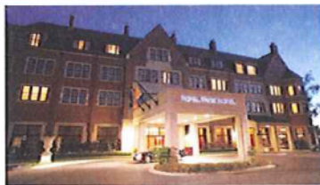
Royal Park Hotel The Escape Package $300 VALUE