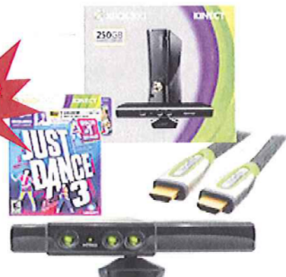
Xbox 360 w/Kinect, Game, Zoom Adapter, HDMI Cable Package $500 VALUE