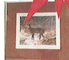
"Sniffing a Hinckley Breeze" by Donald W. BLAISS