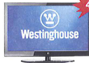
40" Westinghouse LCD HDTV $350 VALUE