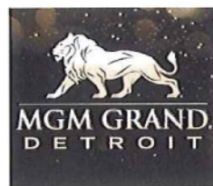
MGM Grand Player Package $289 VALUE