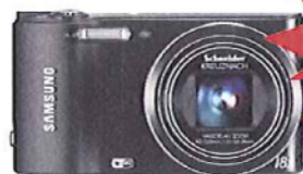
Samsung Wi-Fi 14.0 Megapixel Digital Camera $230 VALUE