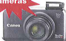
Canon PowerShot SX 14.1 Megapixel Digital Camera $220 VALUE