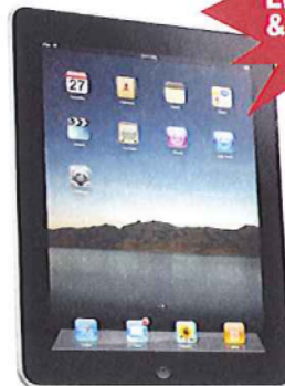
iPad 2 w/WiFi 16 GB $400 VALUE