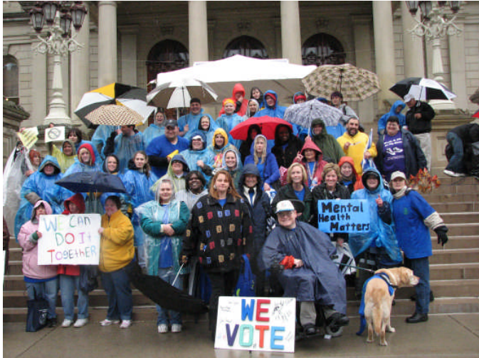
A group of Oakland County participants at the rally.