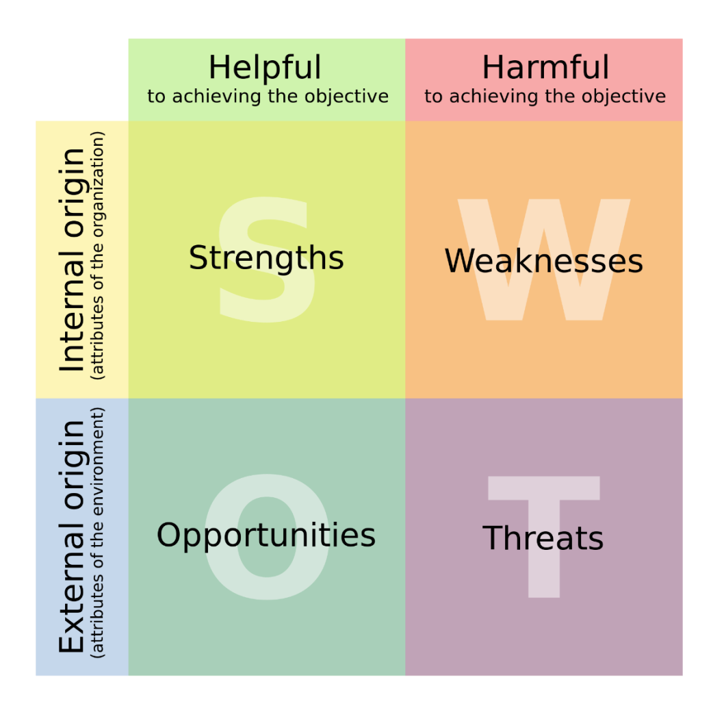
Figure – SWOT Analysis